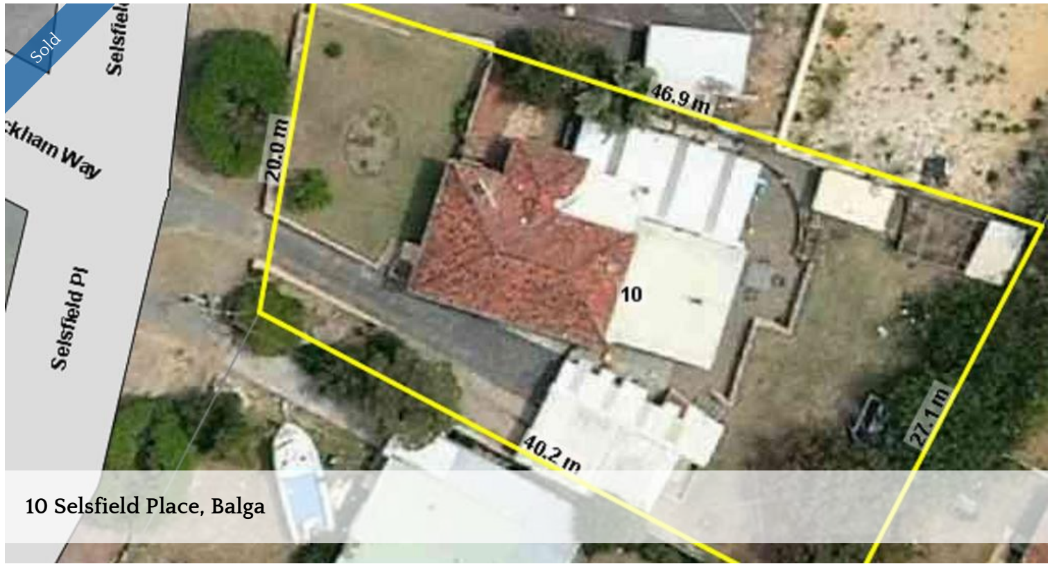
10 Selsfield Place, Balga