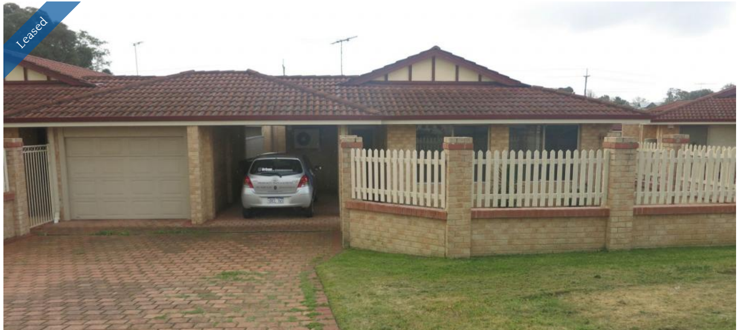
2, 9 Maltarra Place, Nollamara