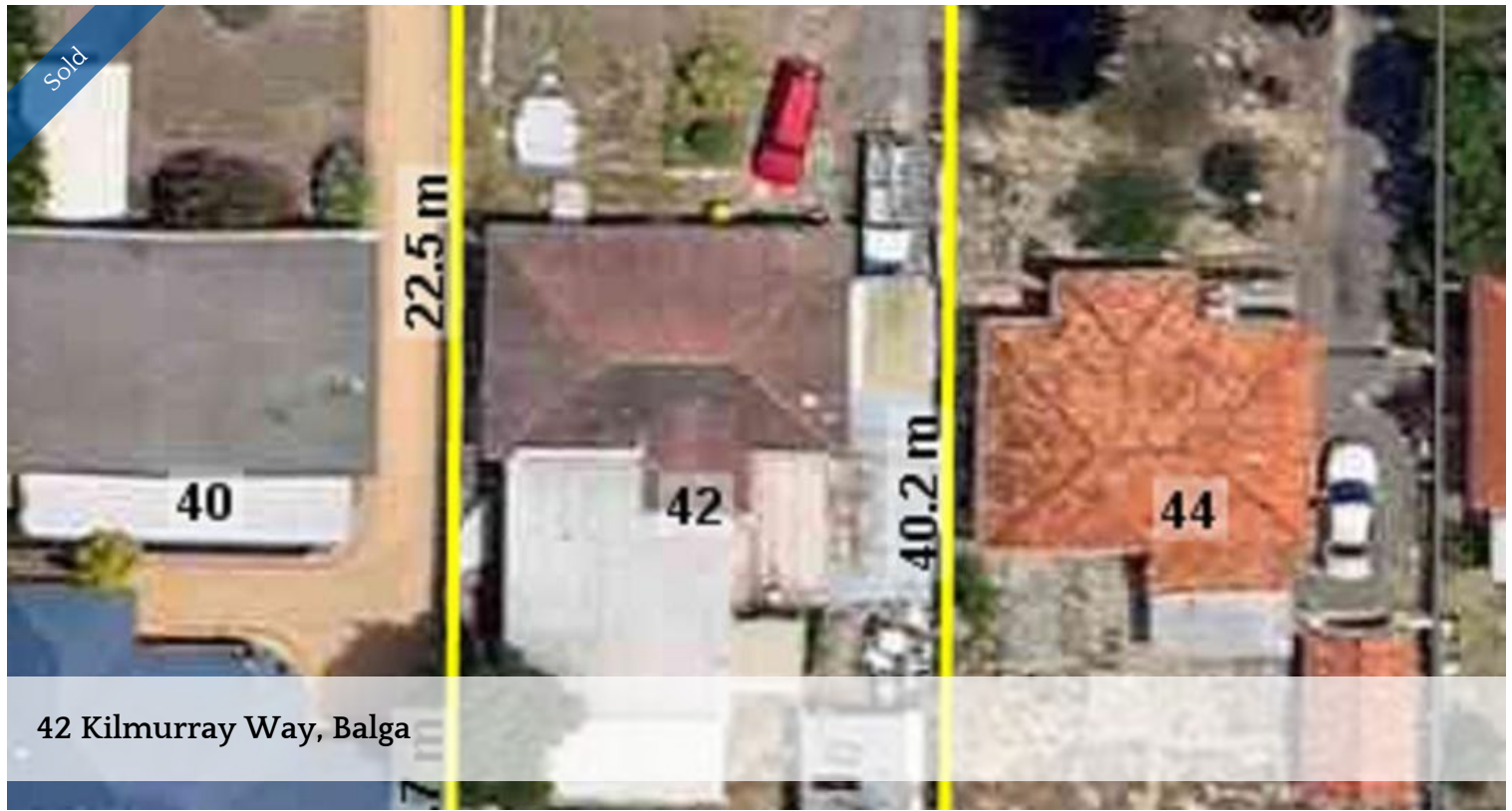
42 Kilmurray Way, Balga