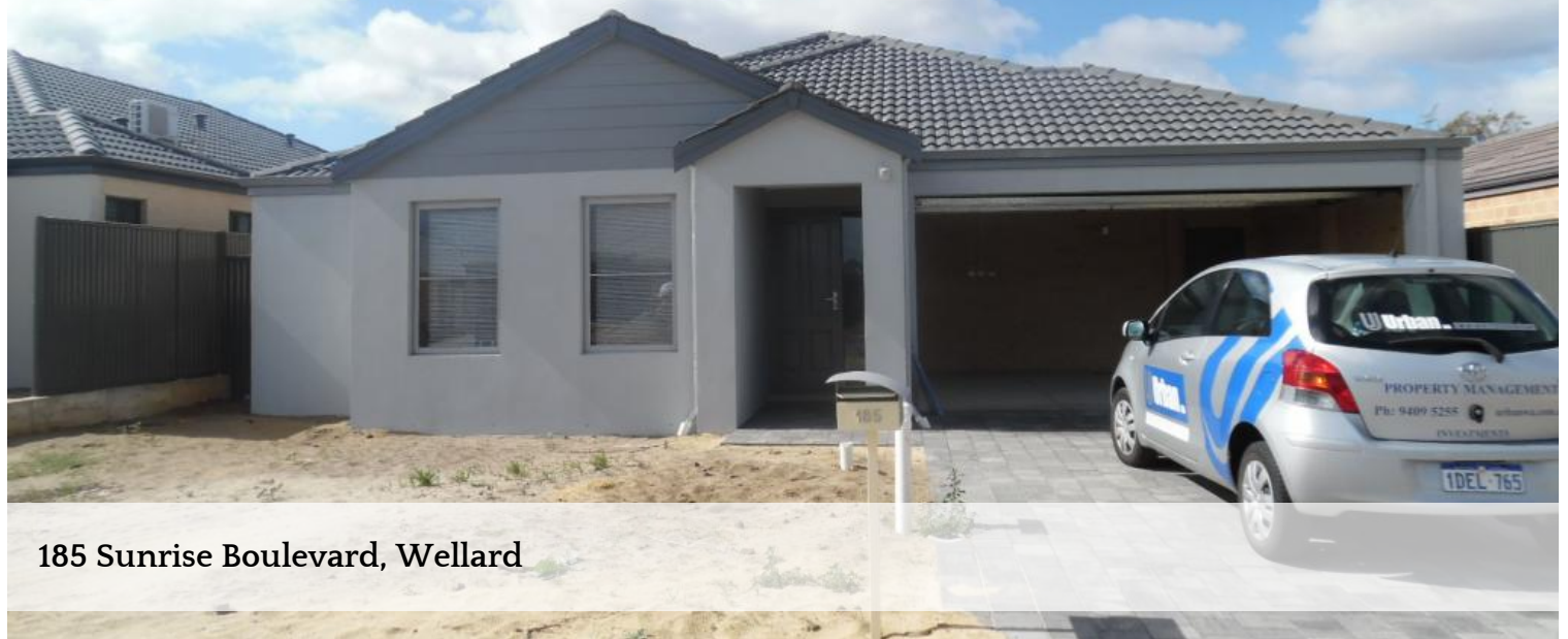
185 Sunrise Boulevard, Wellard