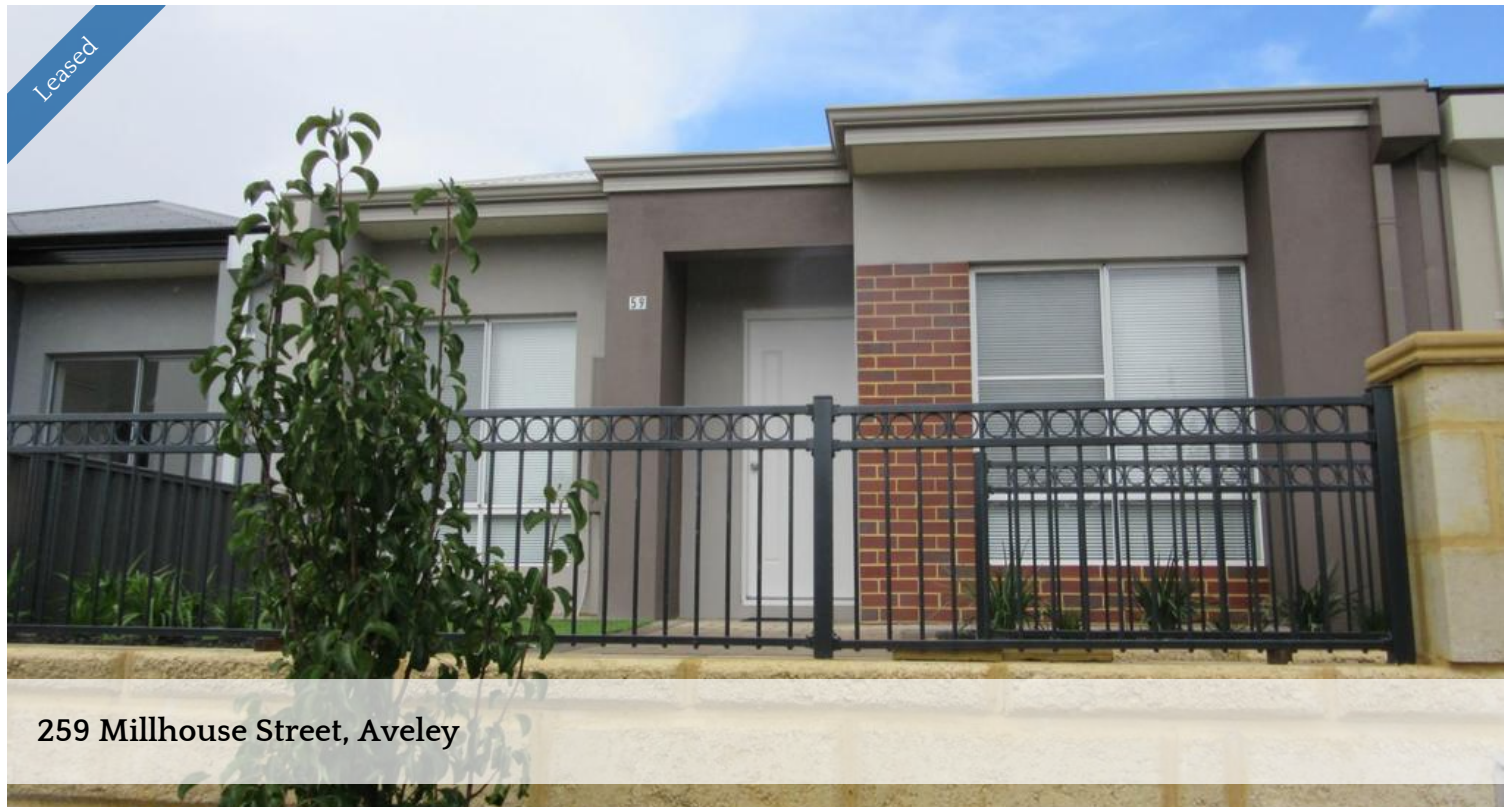
259 Millhouse Street, Aveley