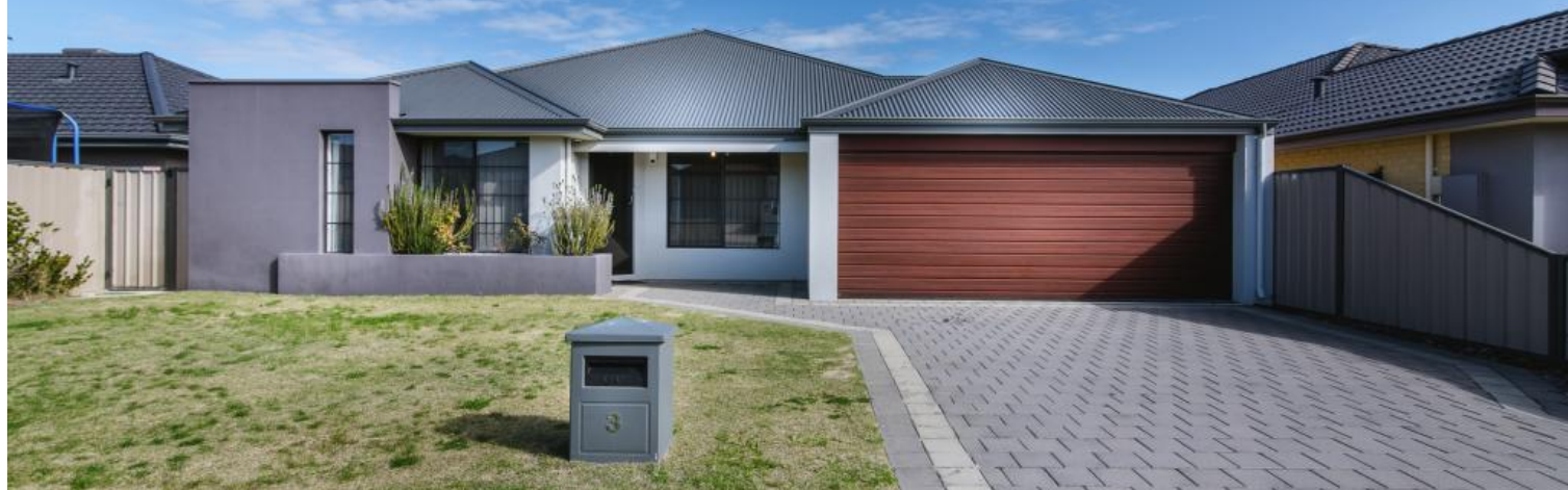
3 Sheffield Avenue, Wanneroo