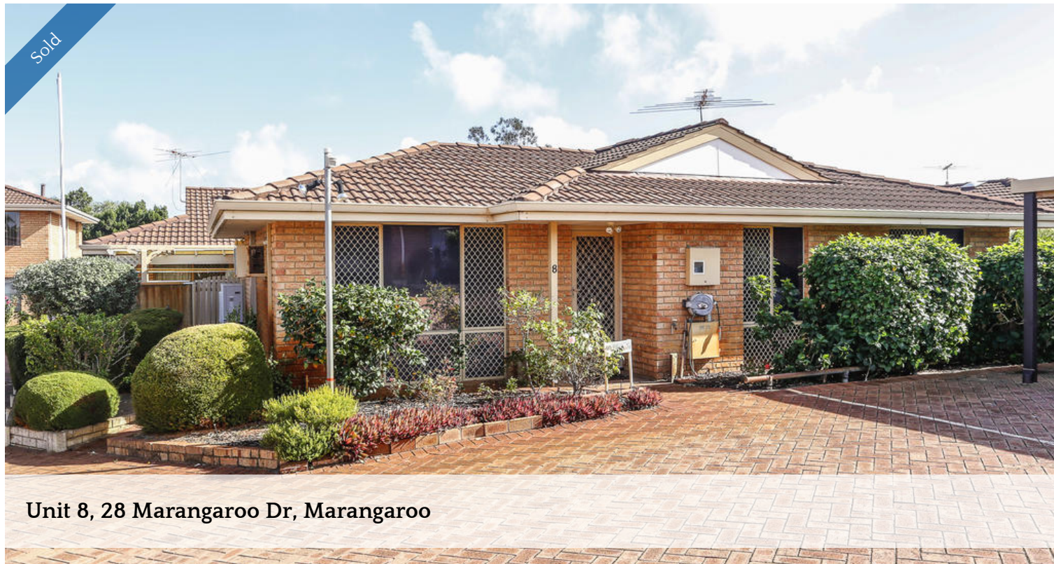
Unit 8, 28 Marangaroo Dr, Marangaroo