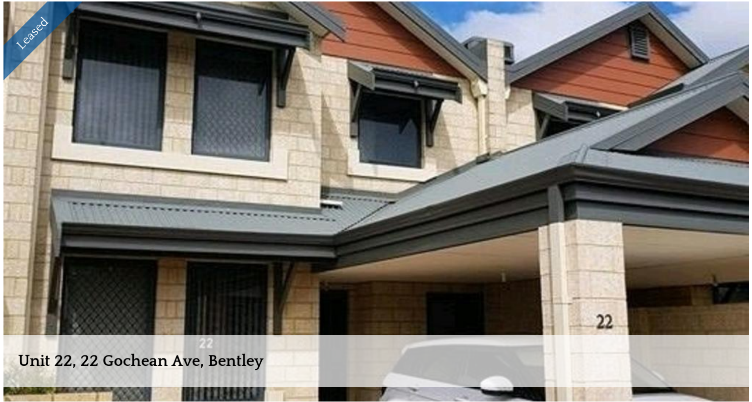
Unit 22, 22 Gochean Ave, Bentley