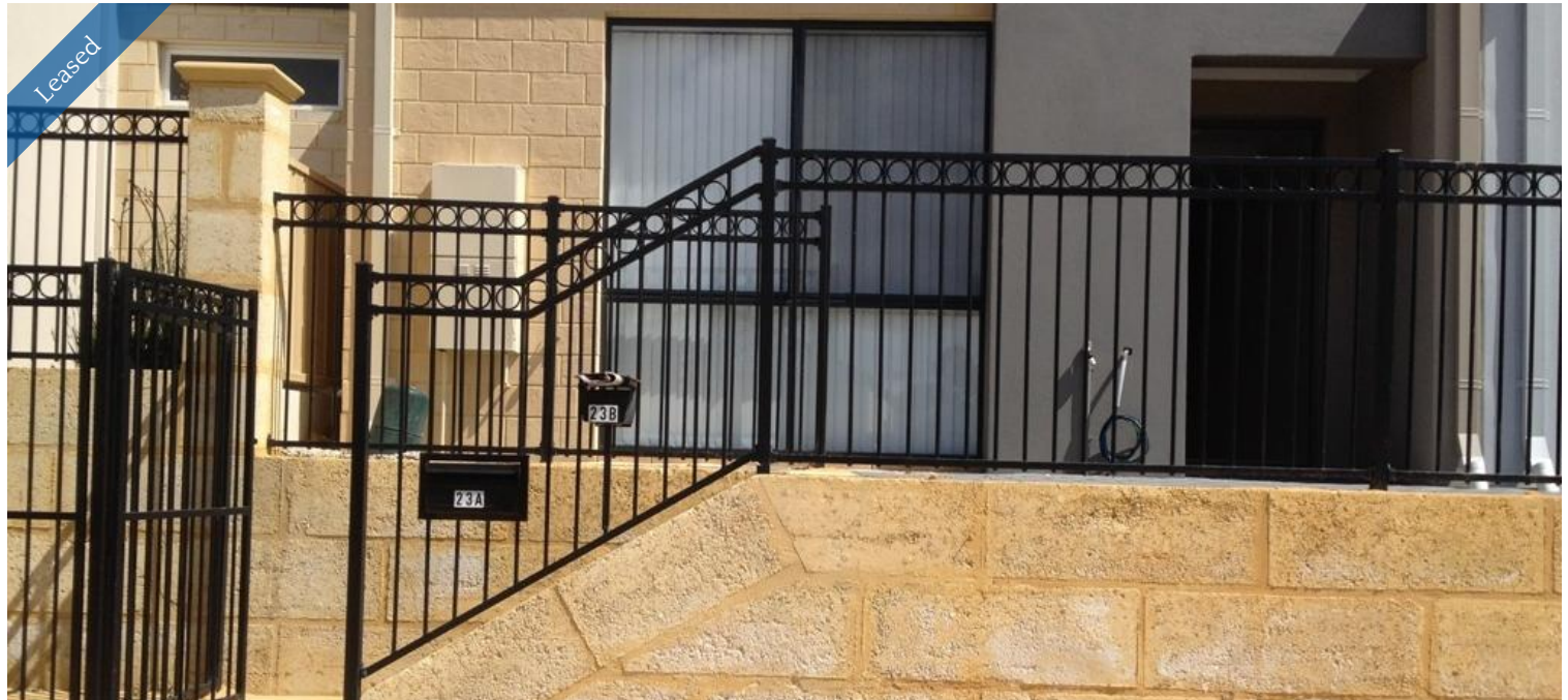
23a Glenkeen Street, Butler