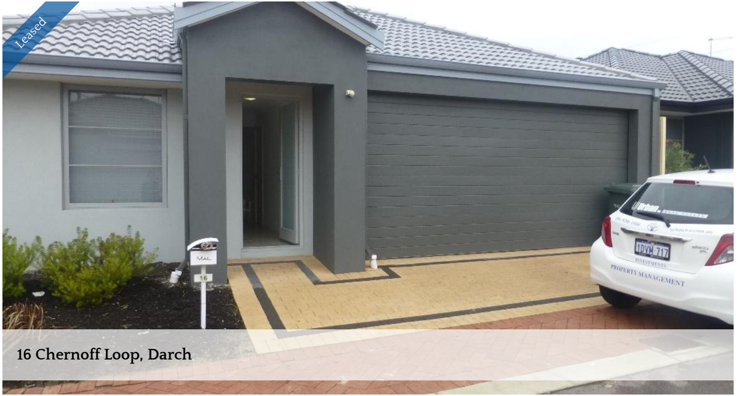
16 Chernoff Loop, Darch