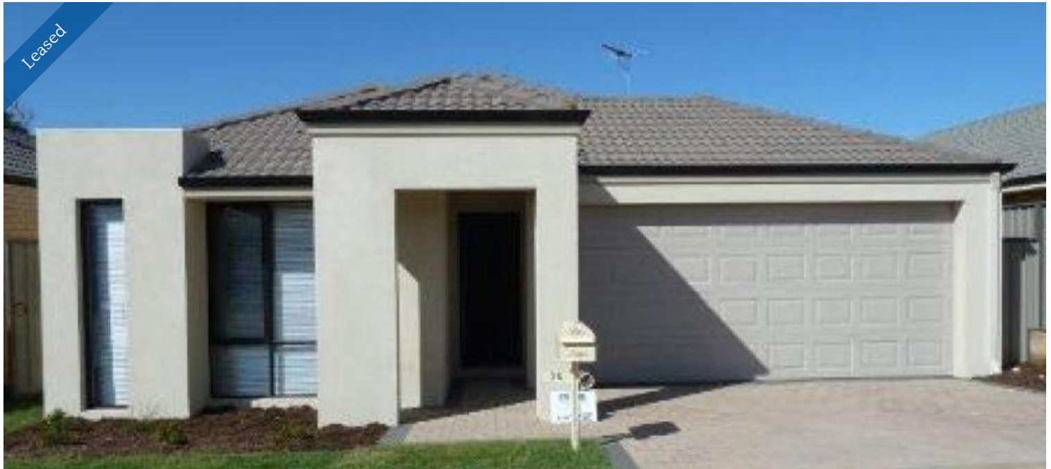
Lot 36 Grafton Rise, Baldavis