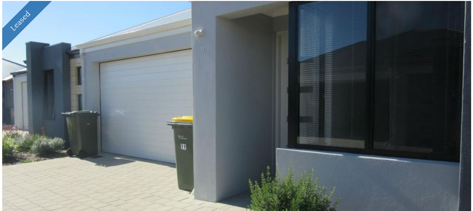
Unit 11, 14 Wallangarra Rd, Carramar