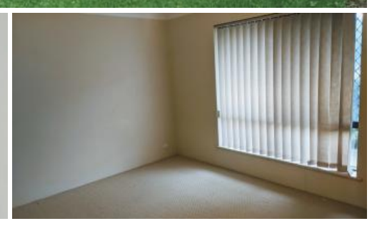
Home Open Tuesday 20th October @ 2.45 -3pm

Come see this well situated family 4 bedroom and 2 bathroom!