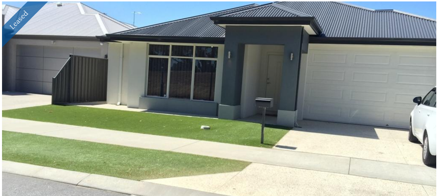
10 Birdie Grove, Yanchep