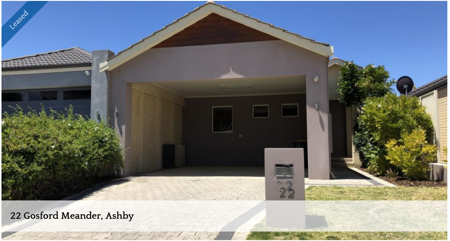
22 Gosford Meander, Ashby