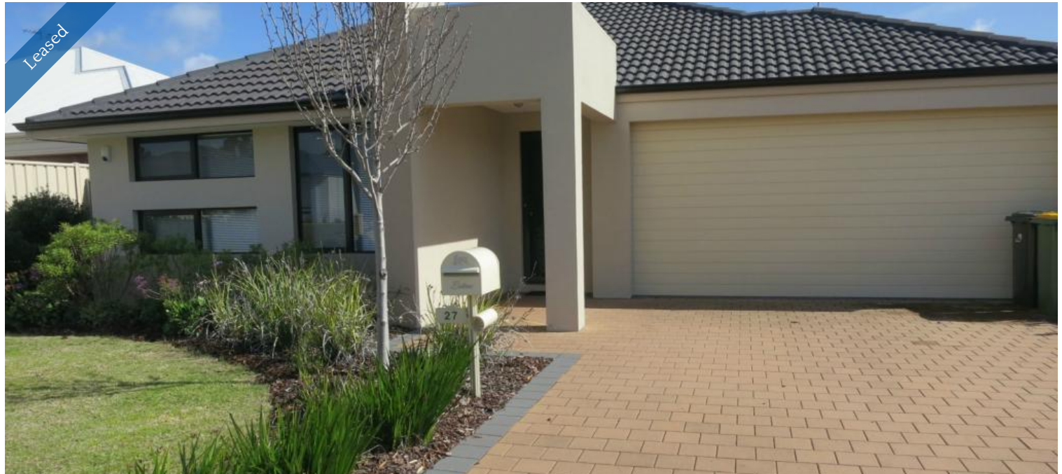
27 Norwich Way, High Wycombe