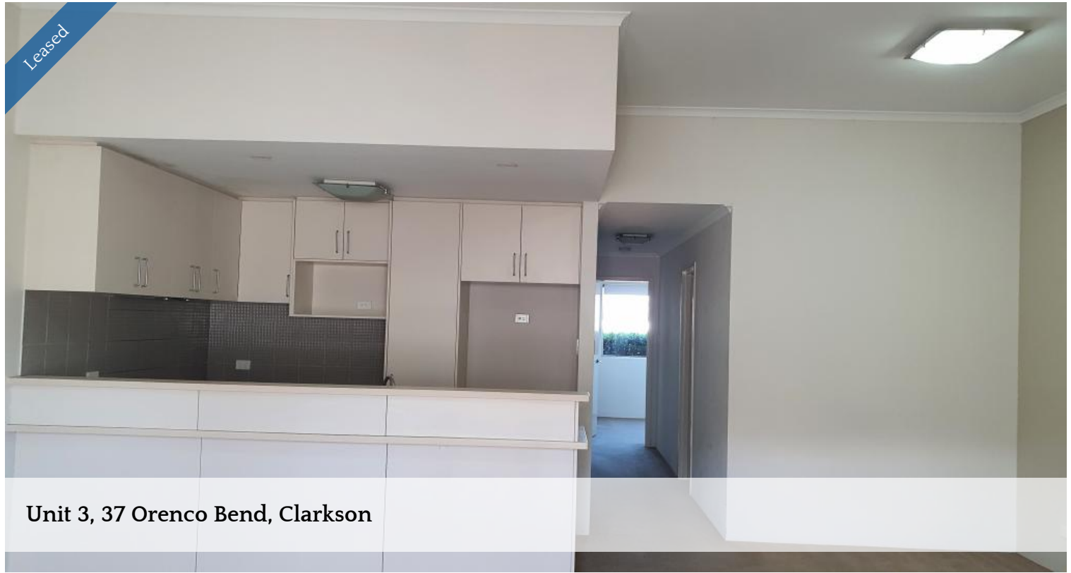
Unit 3, 37 Orenco Bend, Clarkson