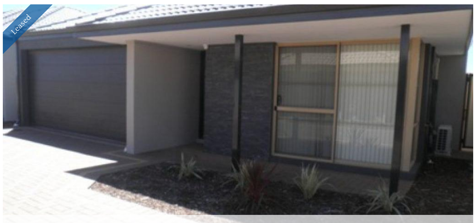
Villa, 2/148 Willespie Drive, Pearsall