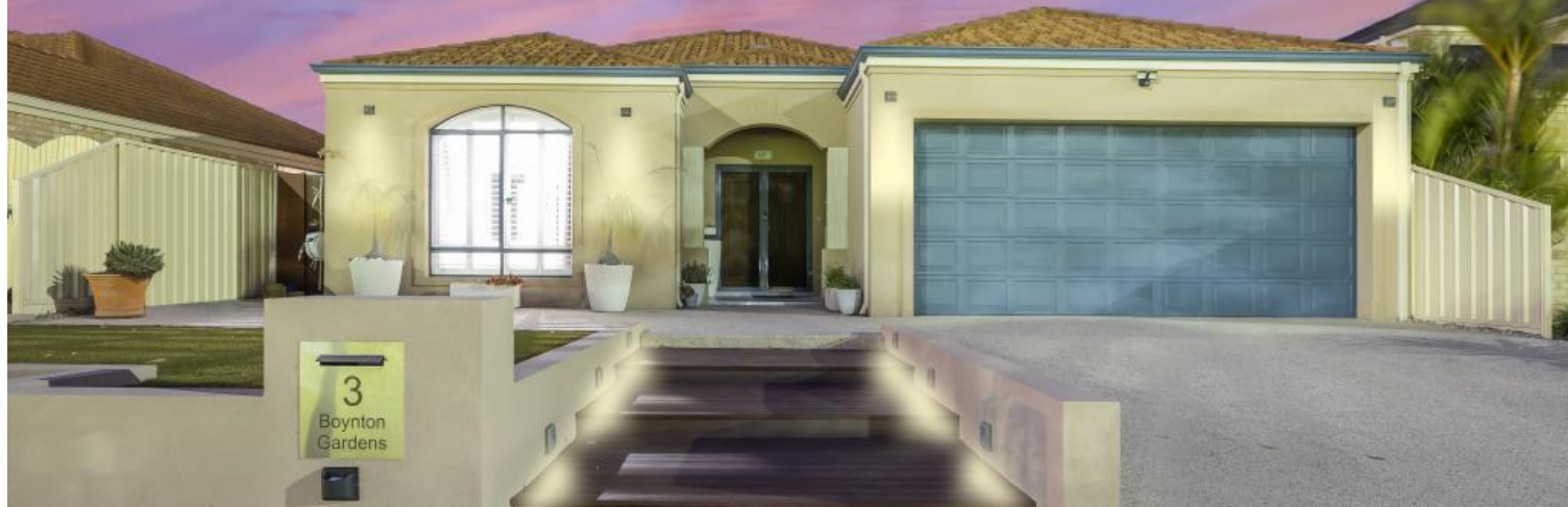
3 Boynton Gdns, Iluka