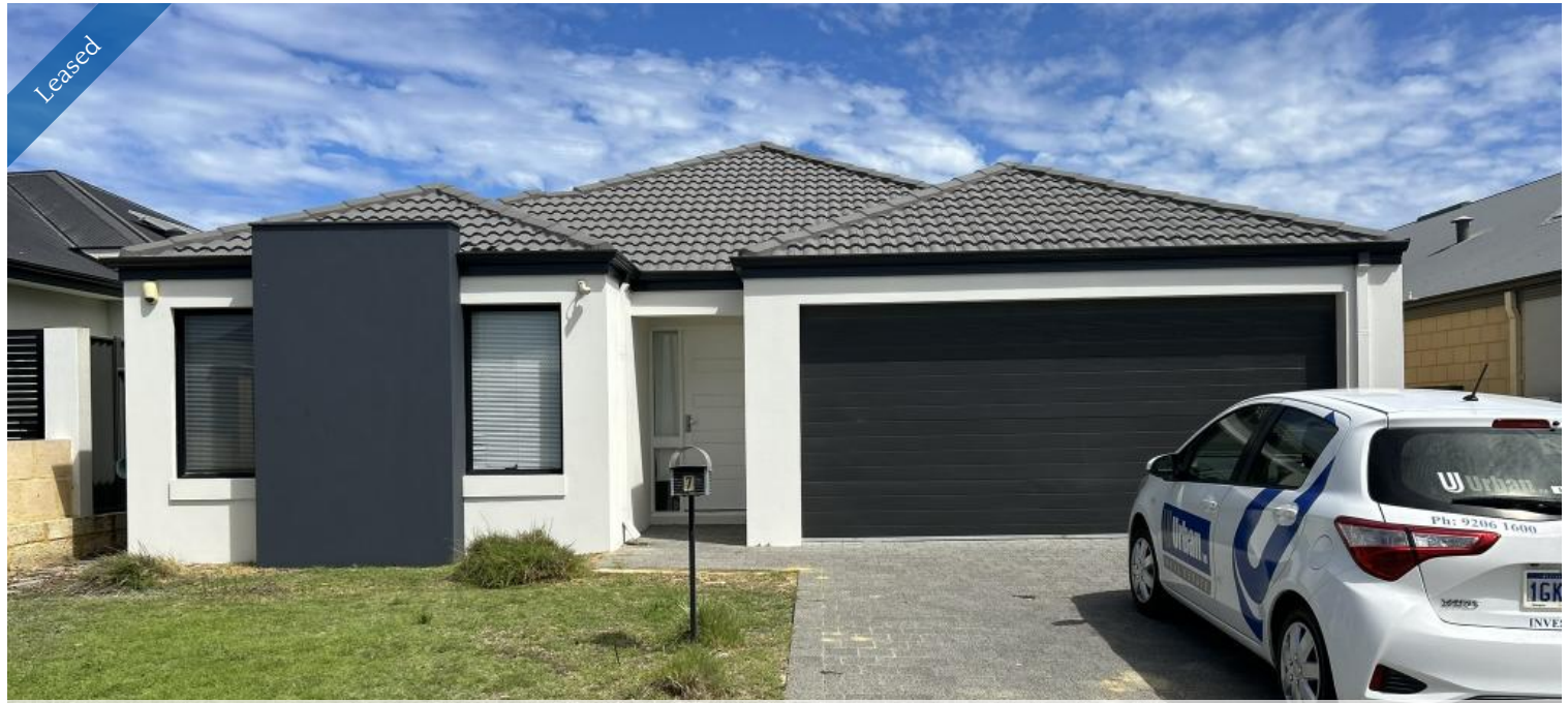
7 Bullata Chase, Jindalee