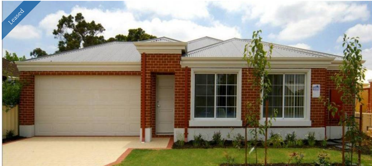
Unit 16, 43 Sixth Road, Armadale