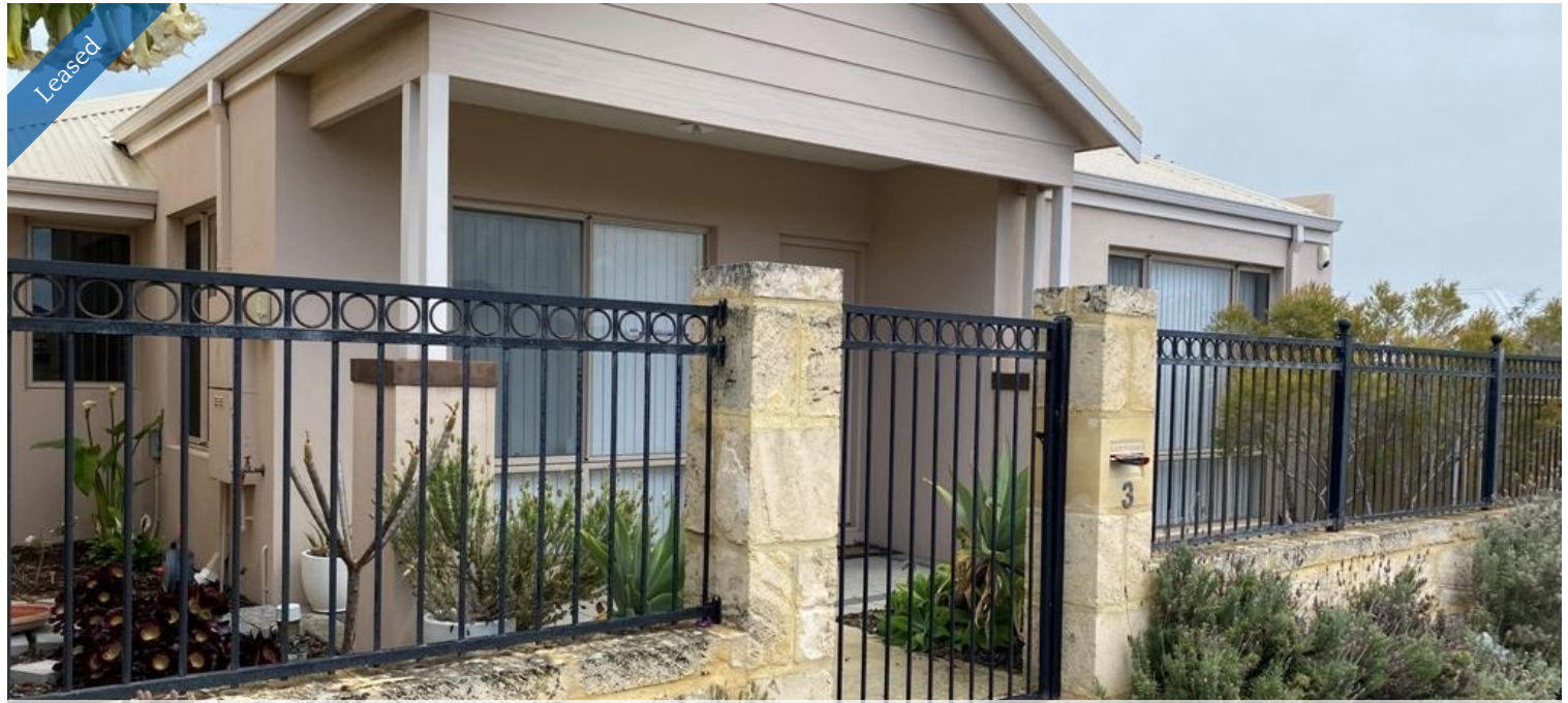
3 Lower Keys Drive, Clarkson