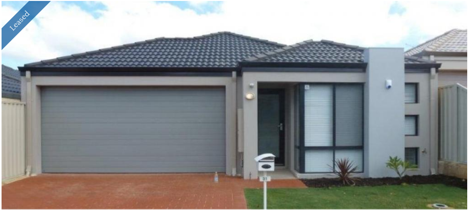
Lot 31 Traminer Way North, Pearsall