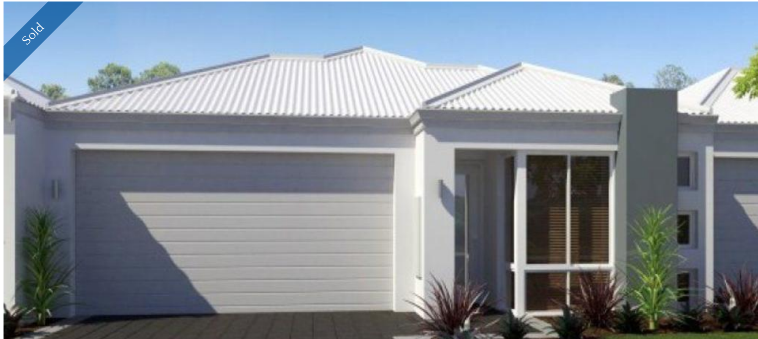
Lot 163 Beachside Parade, Yanchep