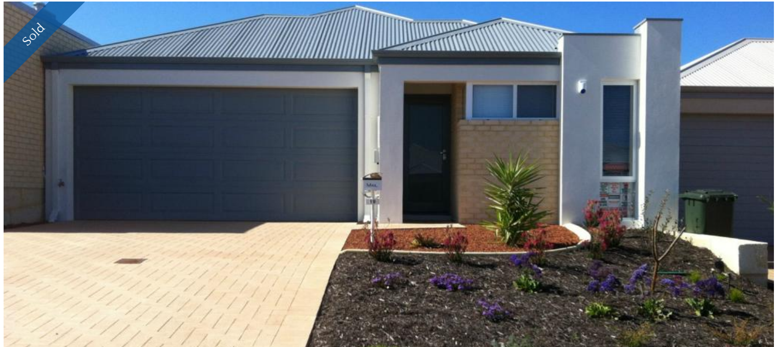
19 Sugarbush Way, Yanchep