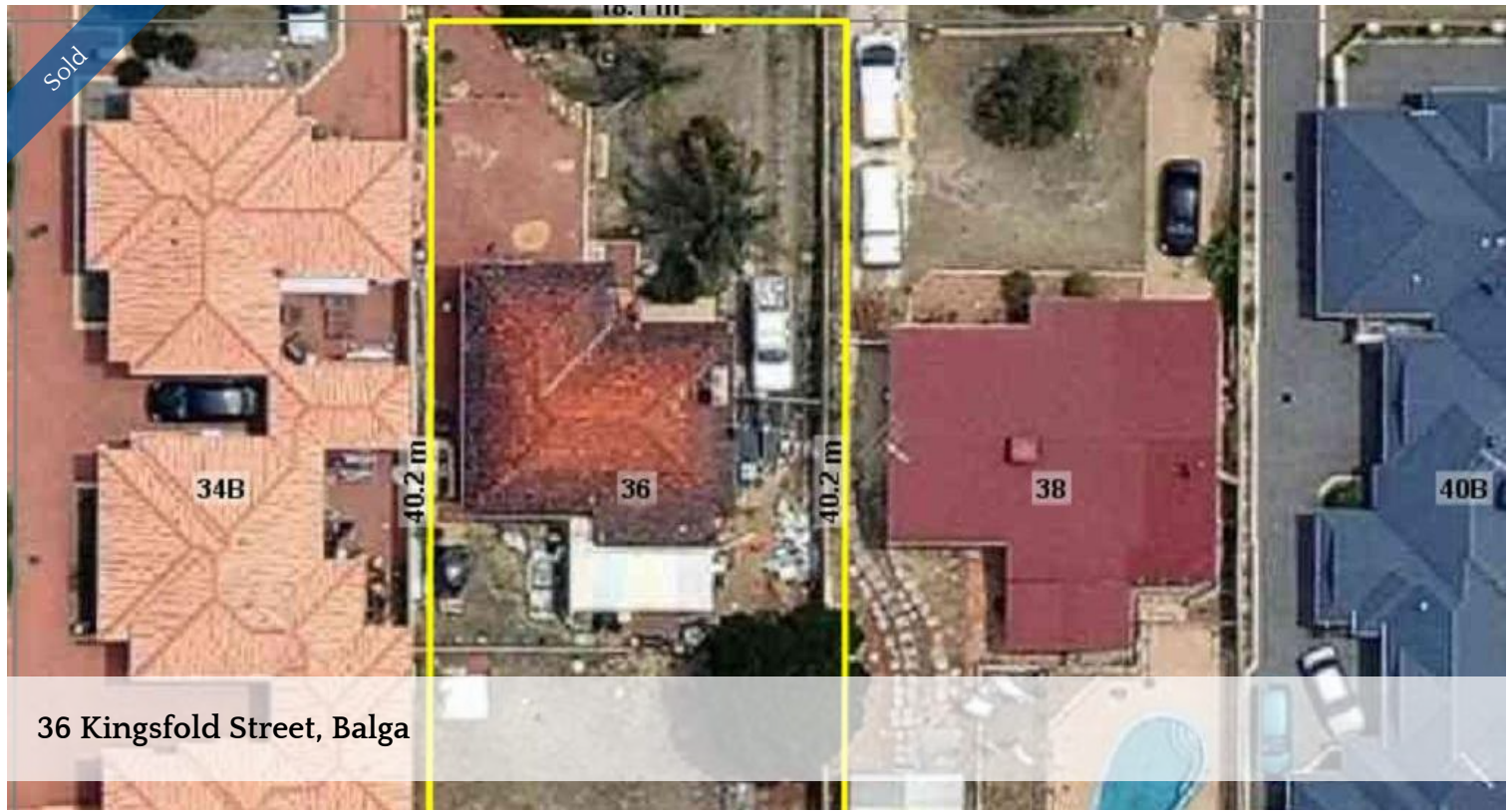
36 Kingsfold Street, Balga