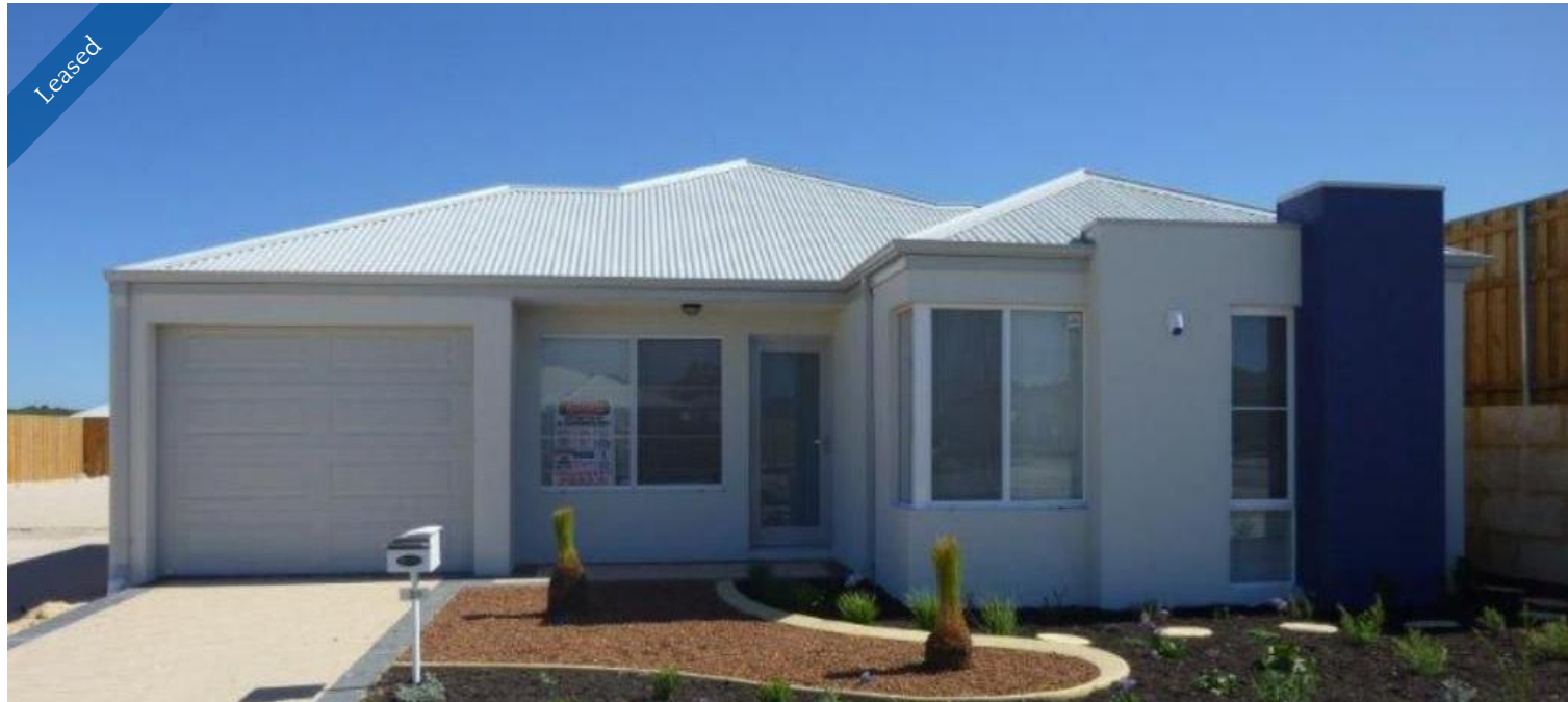
31 Zamia Rise, Yanchep