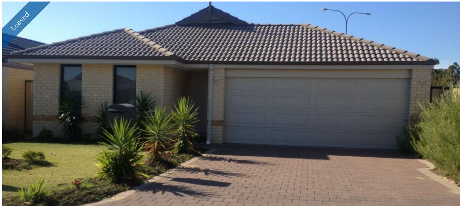
7 Nalgan Court, Carramar