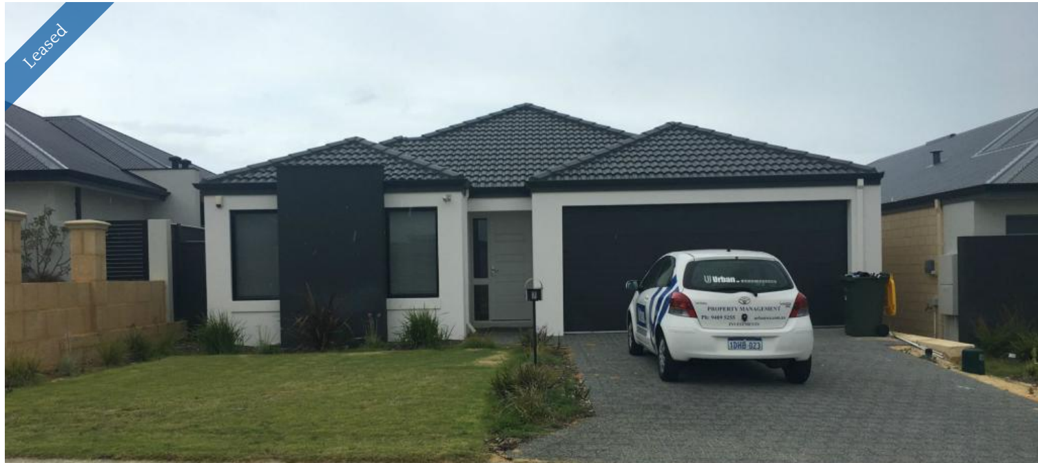
7 Bullata Chase, Jindalee