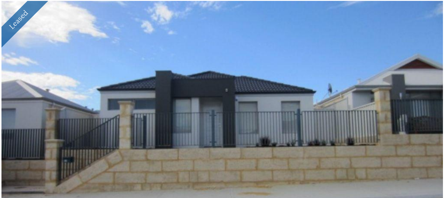
10 Seagull Vista, Jindalee