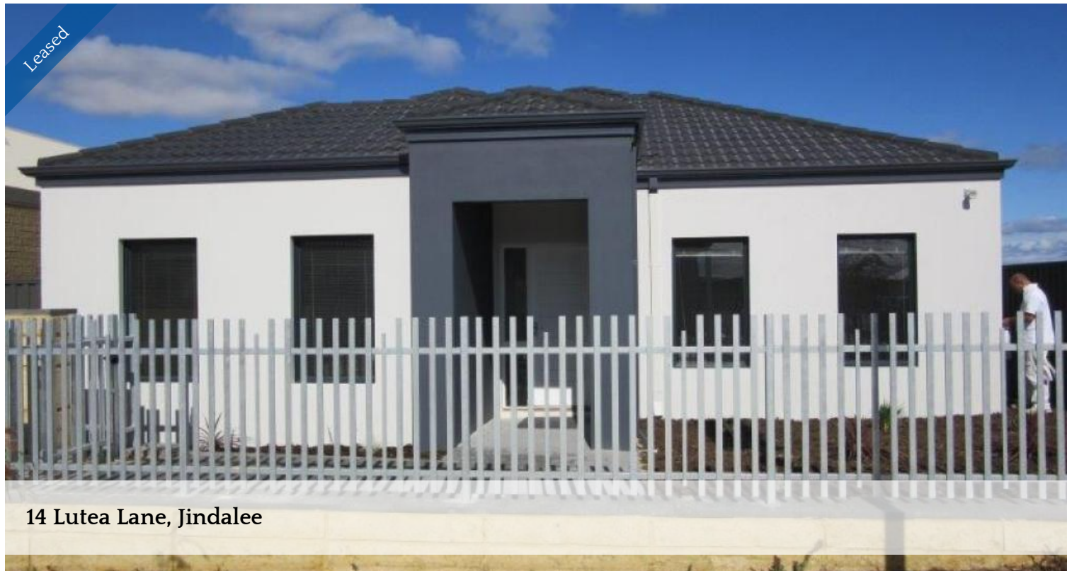
14 Lutea Lane, Jindalee