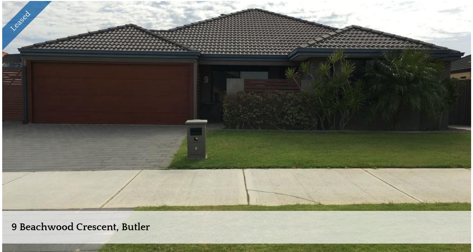
9 Beachwood Crescent, Butler