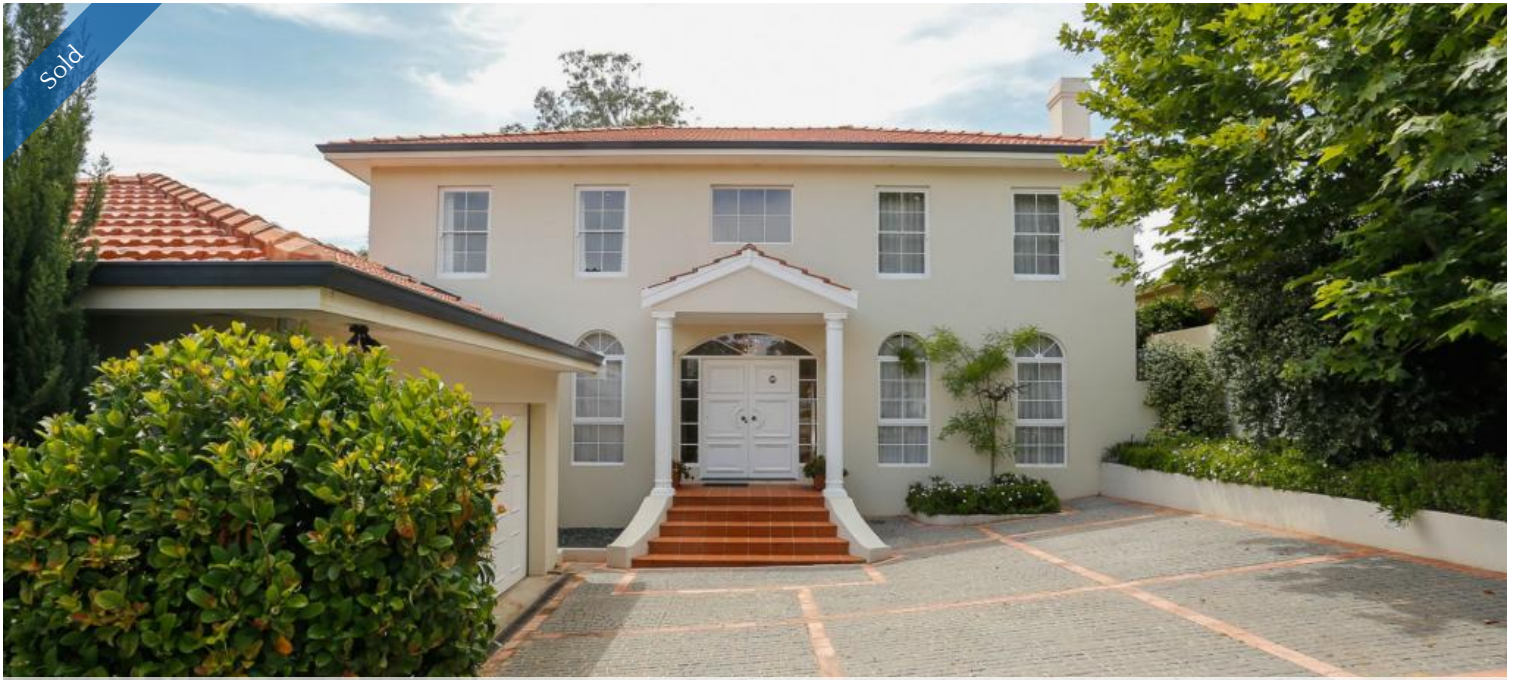
5 Briggs Street, Mosman Park