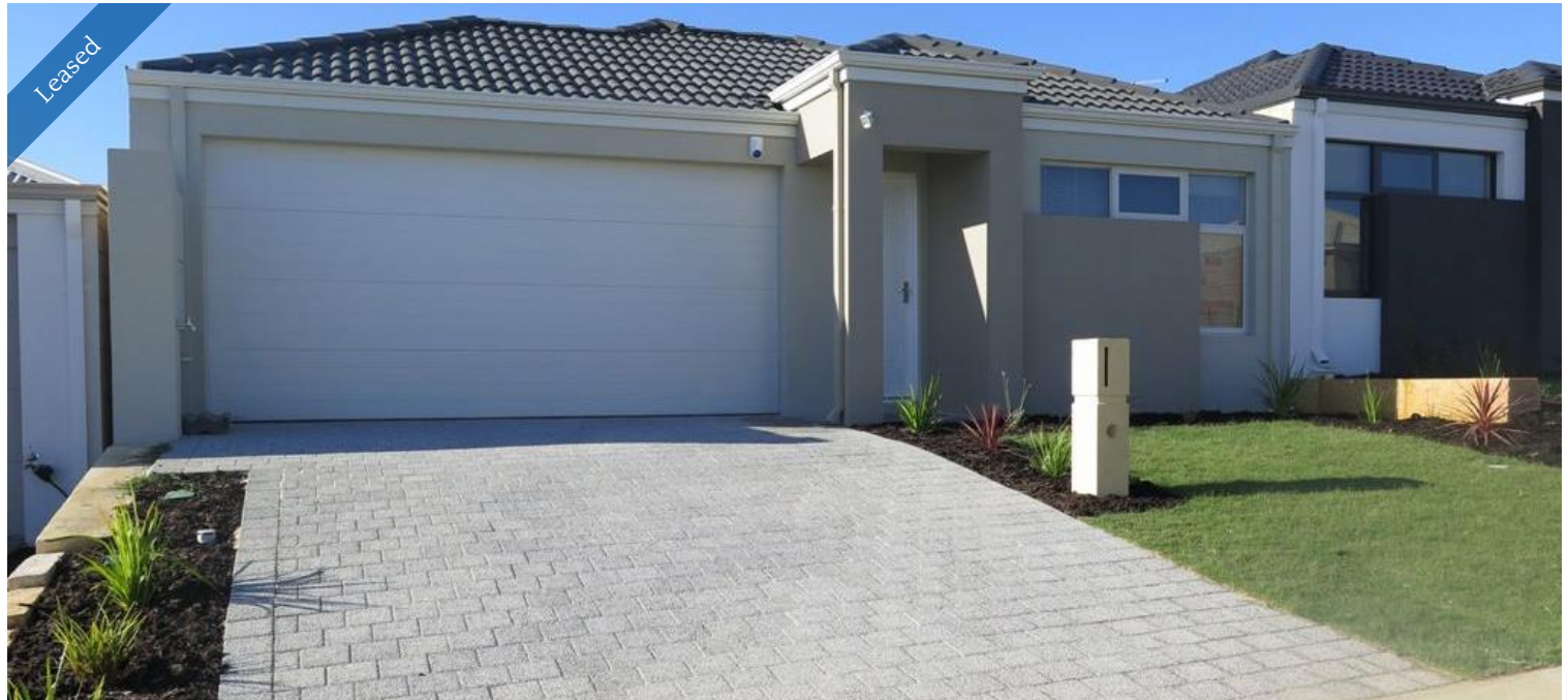
11 Tempranillo Rise, Hocking