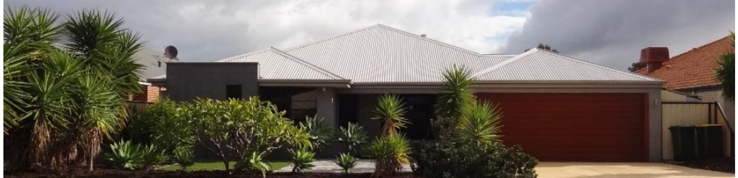
9 Stanbroke Turn, Carramar