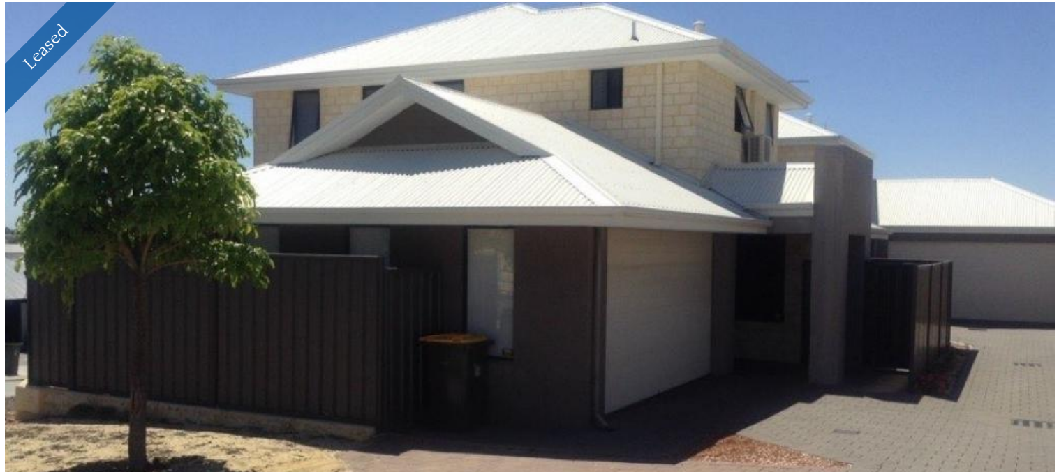
28 Chalkwell Bend, Landsdale