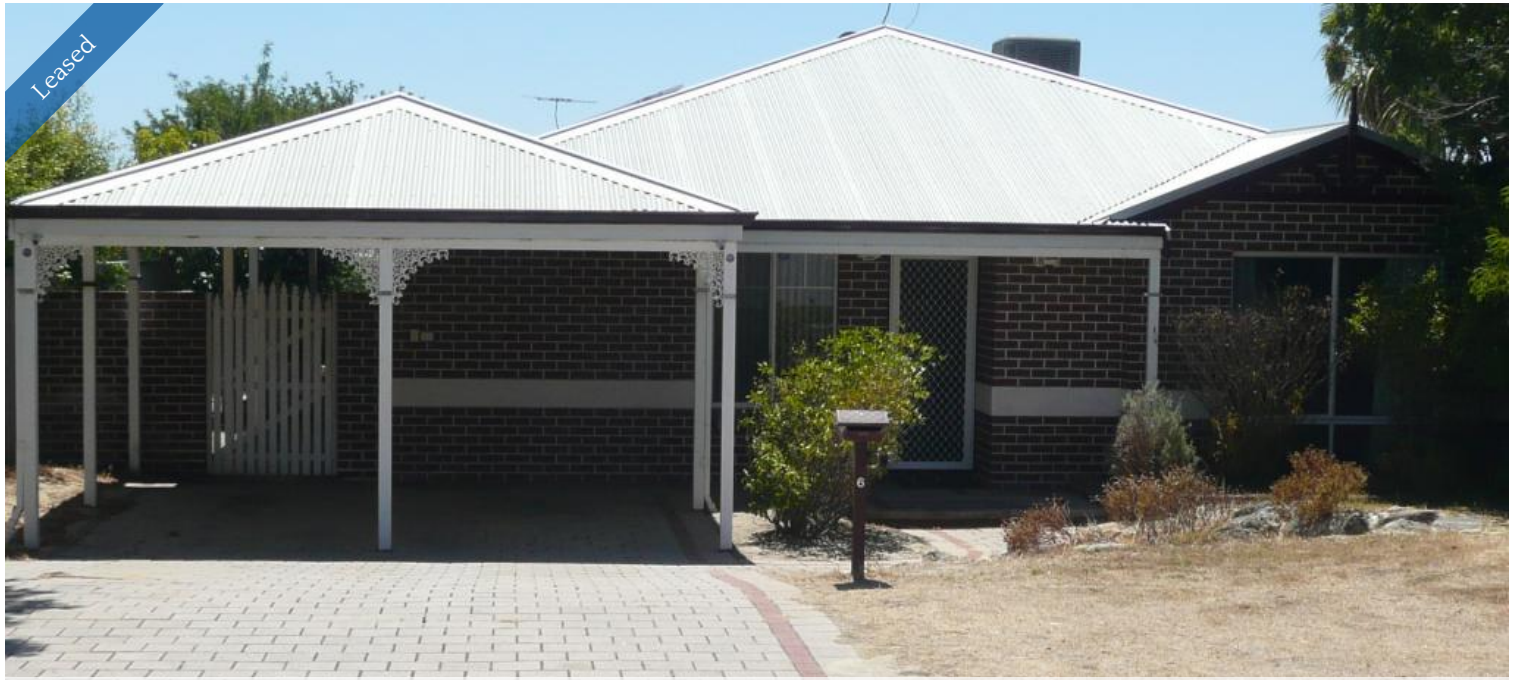
6 Mangrove Cct, Banksia Grove