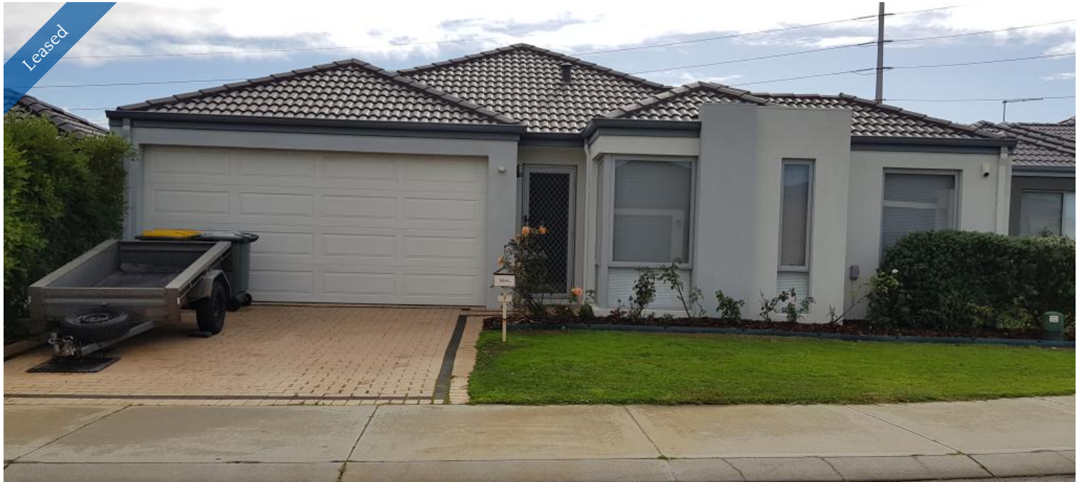
7 Borale Rtt, Darch