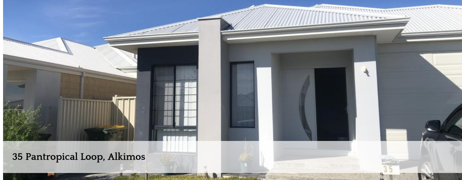
35 Pantropical Loop, Alkimos