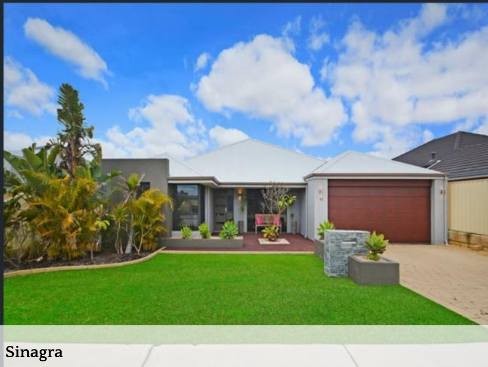
12 Condro Bend, Sinagra