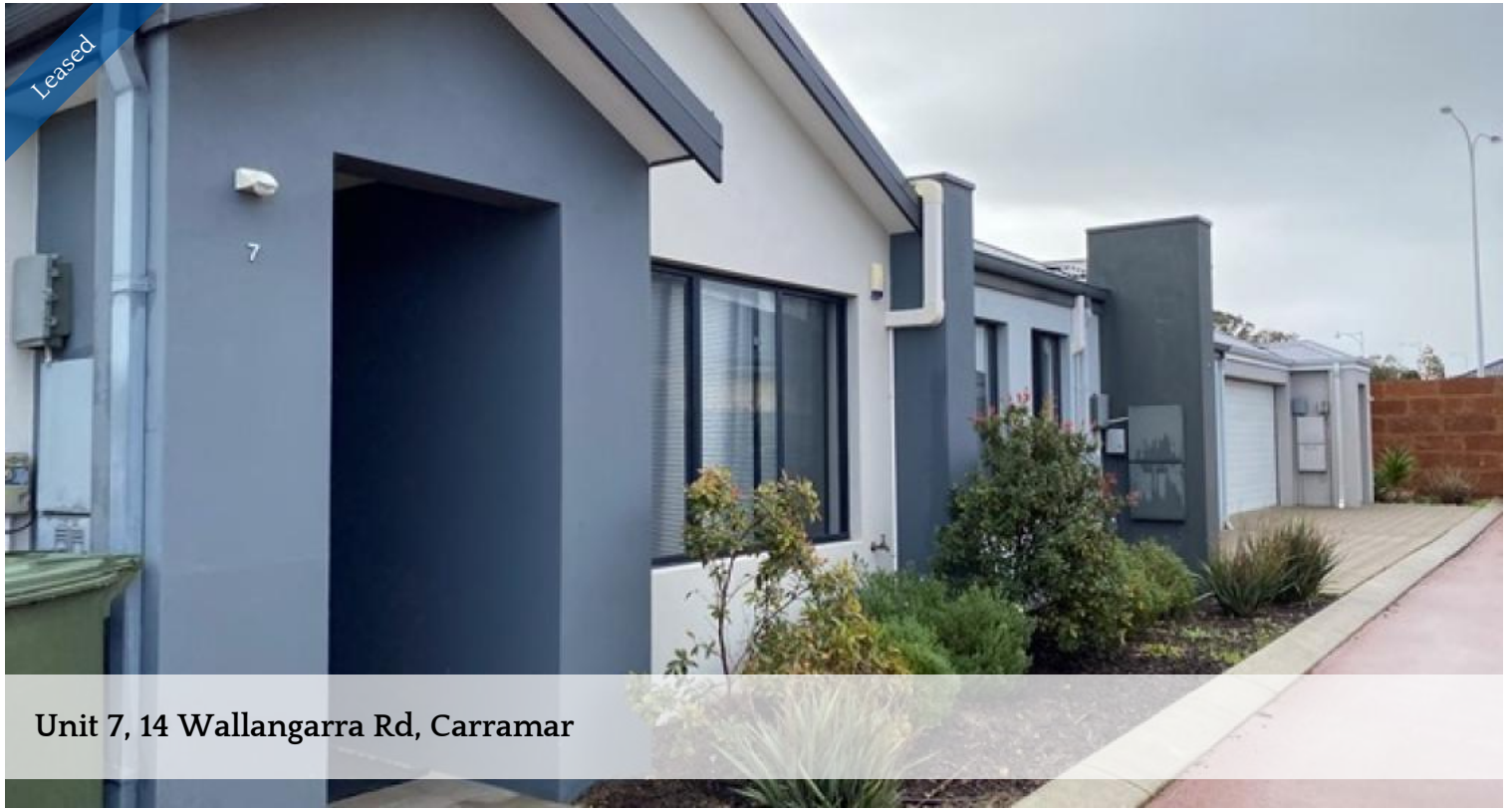
Unit 7, 14 Wallangarra Rd, Carramar