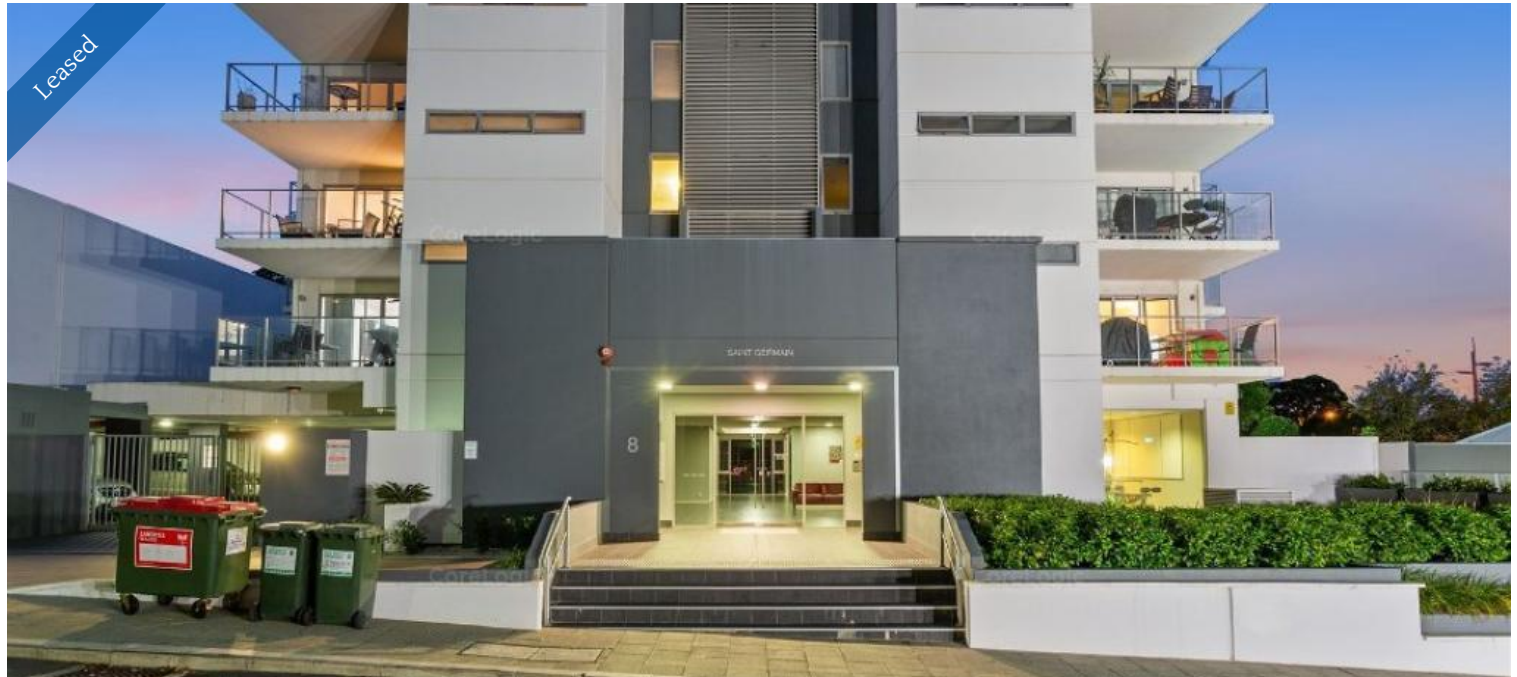
Unit 19, 8 Prowse St, West Perth