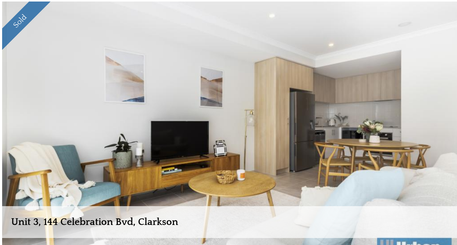
Unit 3, 144 Celebration Bvd, Clarkson