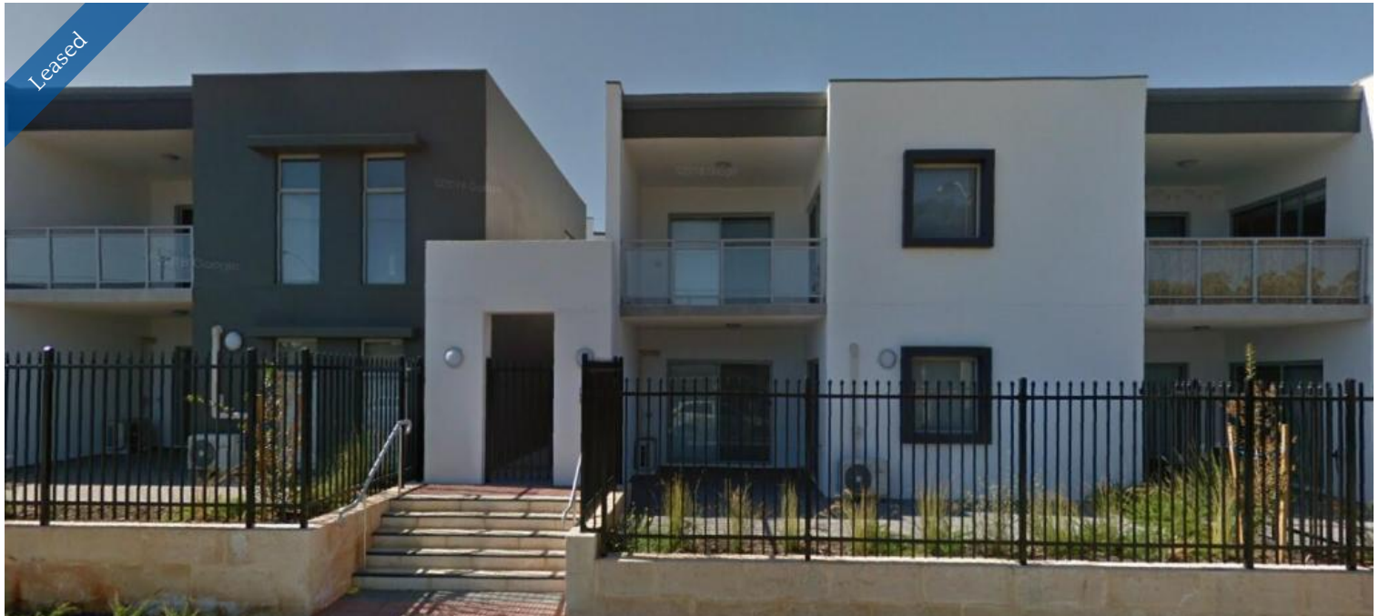
Unit 26, 114 Great Northern Hwy, Midland