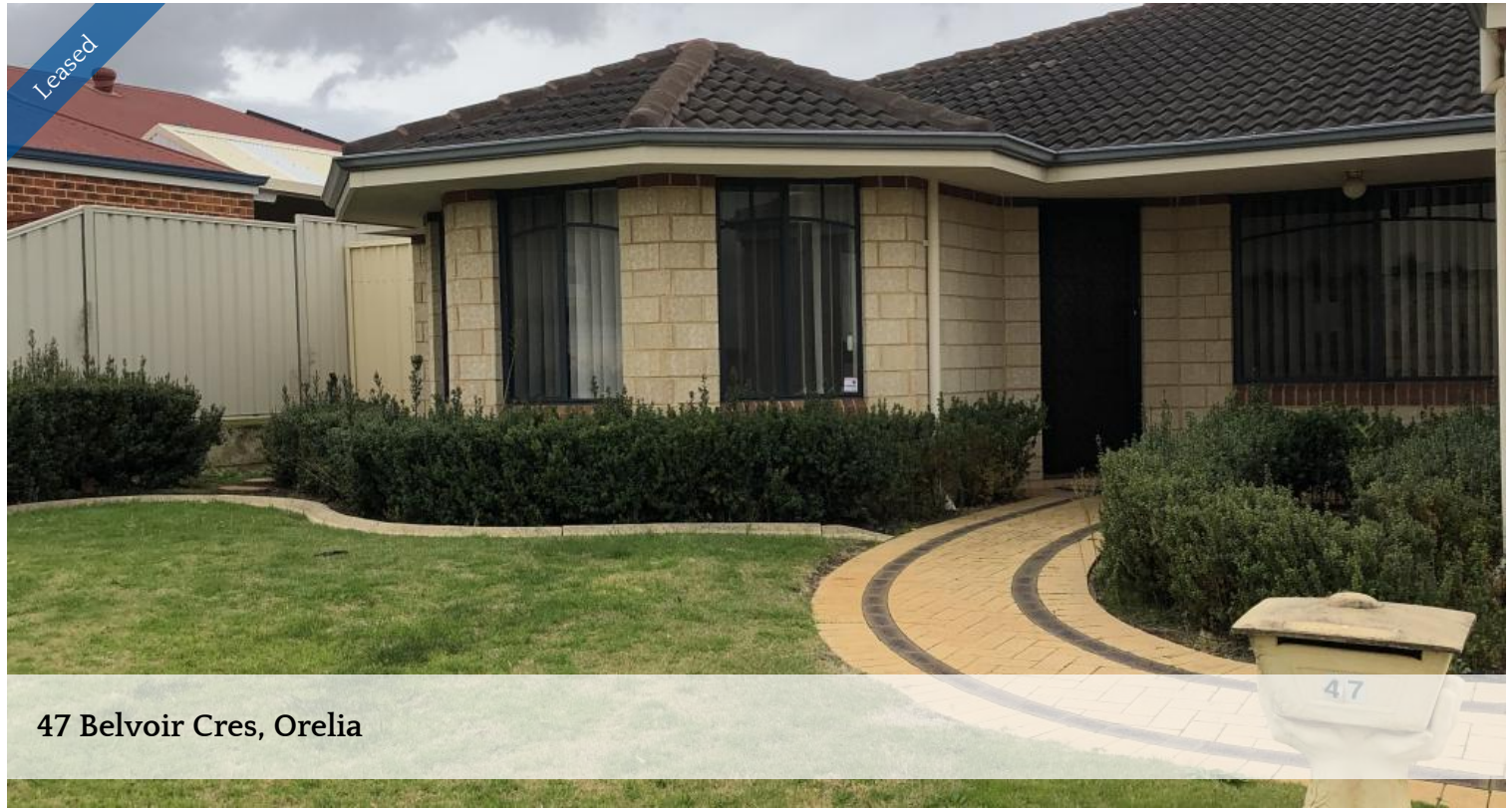
47 Belvoir Cres, Orelia