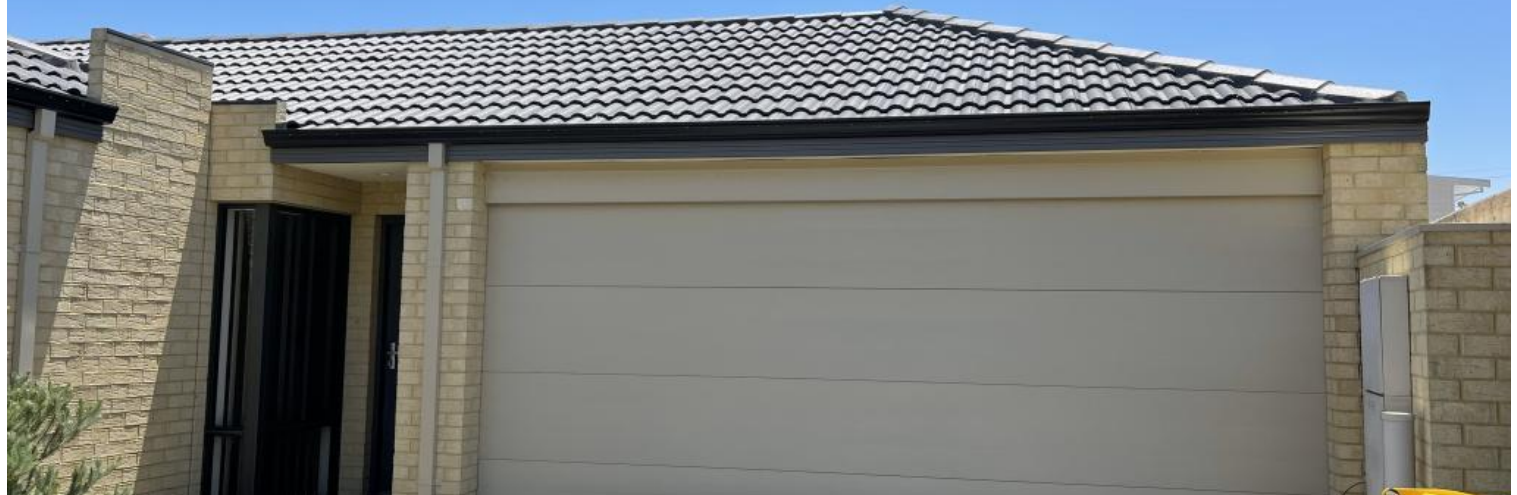
17c Wisborough Crescent, Balga