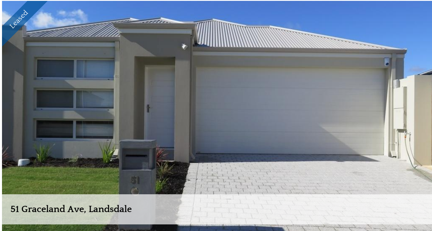
51 Graceland Ave, Landsdale