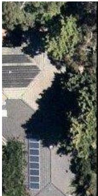
23 Ryan Way, Lesmurdie