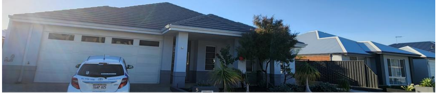
5 Putter St, Yanchep