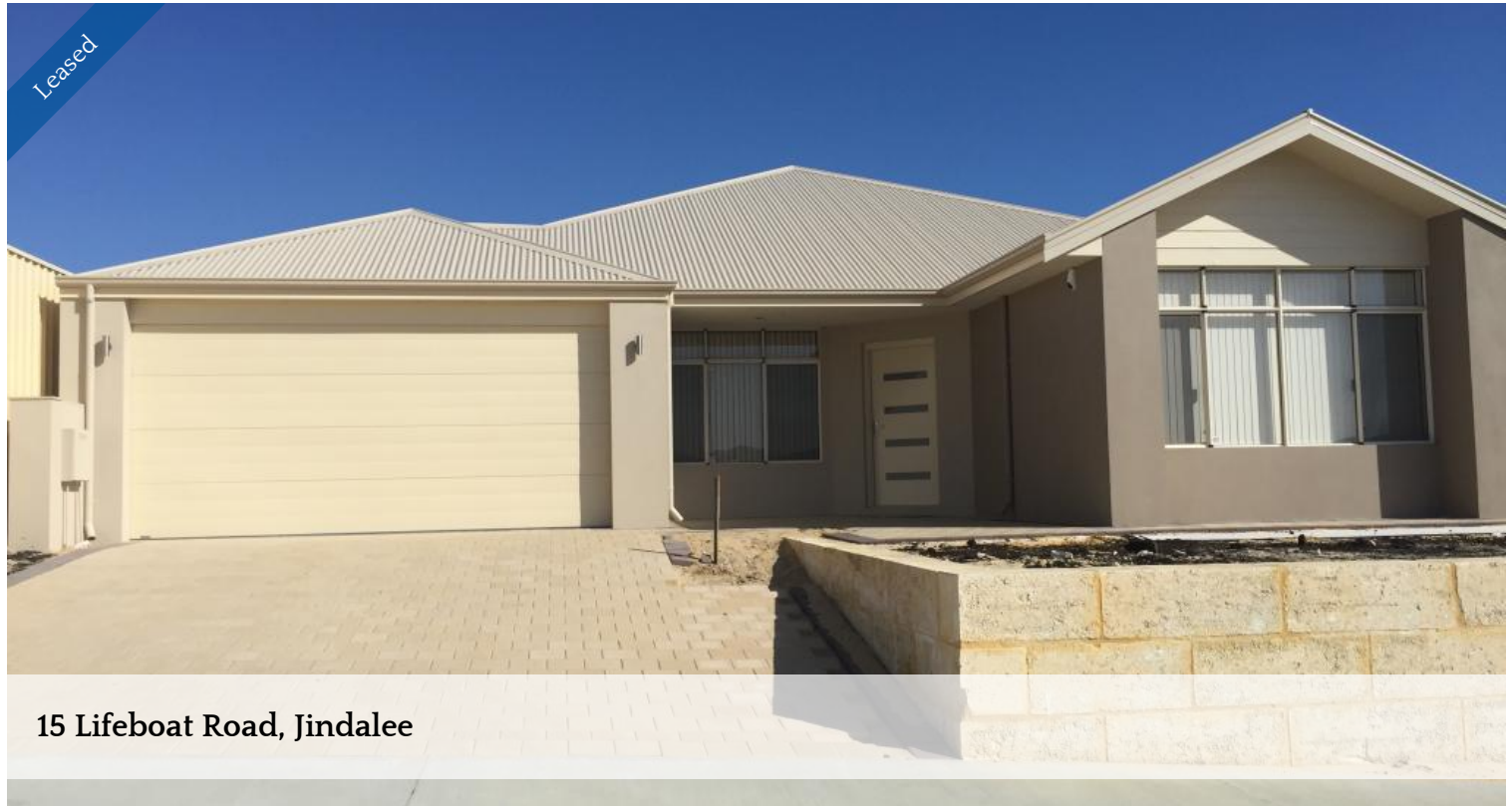
15 Lifeboat Road, Jindalee